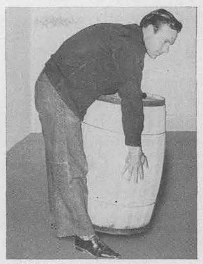
KNOW-HOW in lifting is a must. Here we demonstrate the WRONG way to do it. Use your legs for leverage and save your back. This barrel is empty—fortunately, for injury would otherwise be almost certain.